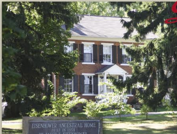
EISENHOWER ANCESTRAL HOME BUILT IN 1854 BY JACOB F. EISENHOWER GRANDFATHER OF DWIGHT D. EISENHOWER 41st PRESIDENT OF THE UNITED STATES OF AMERICA FROM THIS PLACE THE FAMILY MIGRATED TO KANSAS IN THE SUMMER OF 1870.